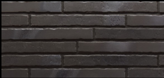
Glanzstück № 1 Δ < 3 % - DIN EN 14411, Gr. A 1