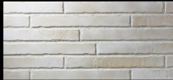
Glanzstück № 4 Δ < 6 % - DIN EN 14411, Gr. A 1 - Part 1