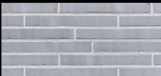
Glanzstück № 7 Δ < 3 % - DIN EN 14411, Gr. A 1