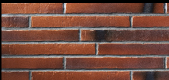
Glanzstück № 5 Δ < 6 % - DIN EN 14411, Gr. A 1 - Part 1