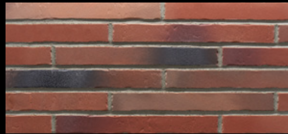
Glanzstück № 2 Δ < 3 % - DIN EN 14411, Gr. A 1