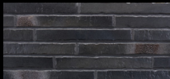
Glanzstück № 6 Δ < 3 % - DIN EN 14411, Gr. A 1