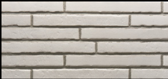
Glanzstück № 3 Δ < 6 % - DIN EN 14411, Gr. A 1 - Part 1