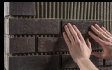
Use a string to plumb the clinker area. The clinker slips are pressed into the adhesive bed.