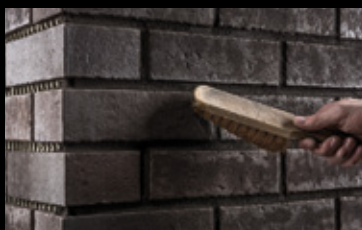
Sweeping out the joint gives it a corresponding structure.