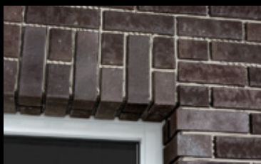
Window lintel perfectly replicated with angles.

JOINTING: After applying the clinker slips and after a corresponding drying time (see the adhesive manufacturer's instructions), a start can be made on grouting. Clinker slips with smooth surfaces can be processed by the slurry method. There are a number of grouts on the market but some have plastic and pigment additives. For this reason, you should always consult the mortar manufacturer regarding suitability before choosing the grout. All rough, patinated and textured surfaces are grouted with a conventional pointing trowel and a metal float.