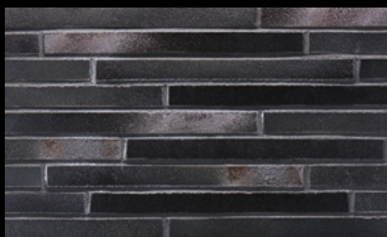
456 black-blue Δ < 6 % · DIN EN 14411, Gr. AII 0 -Part 1