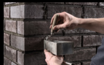
The vertical joints can be finished more easily with a smaller pointing trowel.