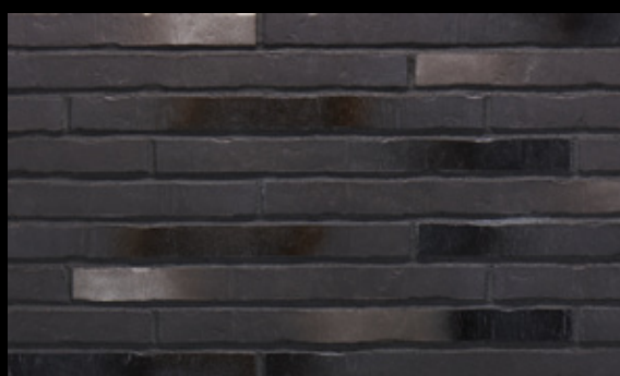
453 silver-black Δ < 6 % · DIN EN 14411, Gr. AII 0 -Part 1