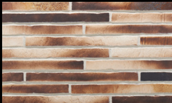
451 golden-brown Δ < 3 % · DIN EN 14411, Gr. AI 0