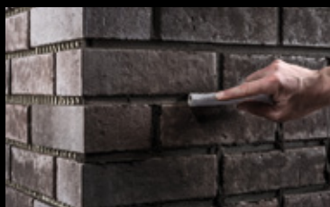
Jointing with a trowel allows you to create different looks.