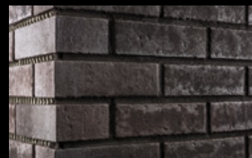
The finished joint pattern. Full masonry stretches are grouted at one go.