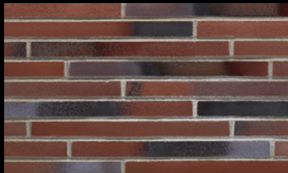
455 brown-blue Δ < 3 % · DIN EN 14411, Gr. AI 0