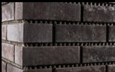
The finished surface. Grouting can be done after the appropriate drying time.