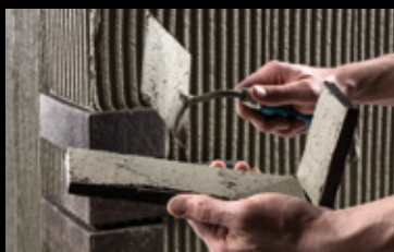
The corner angles are worked using the floating-buttering method.