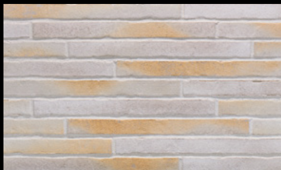
450 golden-white Δ < 6 % · DIN EN 14411, Gr. AII 0 -Part 1